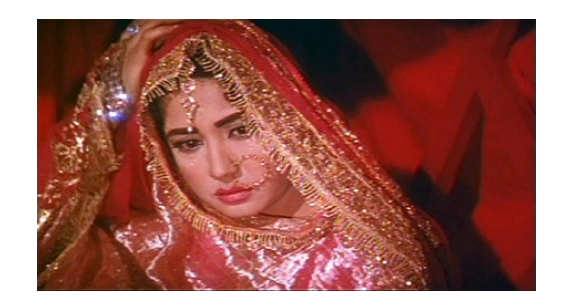
Pakeezah (still): Sahibjaan is now the married and voiceless Pakeezah.

Pakeezah (still): Sahibjaan sings provokingly of the 'wounds' of love in Salim's courtyard, mentioning all that cannot be said.